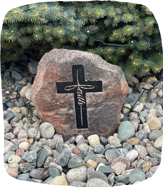
Look what showed up in the prayer garden.

If you, or anyone you know, would like to be added to this list of prayers for healing, please call or email the church office.