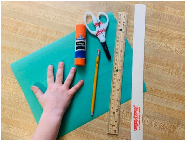
STEP 1. Supplies needed include: green construction paper (or white paper and color it), a pencil, your hand, scissors, glue, and a paint stir stick/ruler/large popsicle stick.