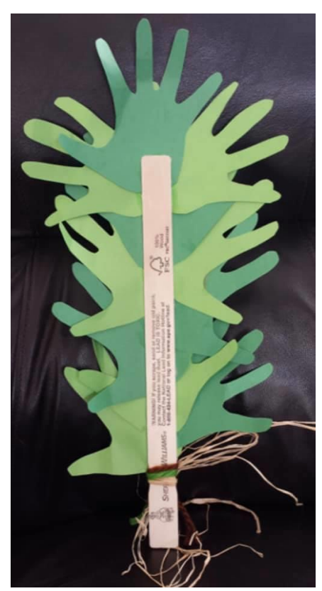
STEP 4. Glue your paper hands to the stir stick/ruler/popsicle stick.