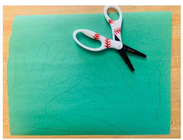
STEP 3. Cut out your hands from the paper. Color the hands before cutting the paper if using white paper.