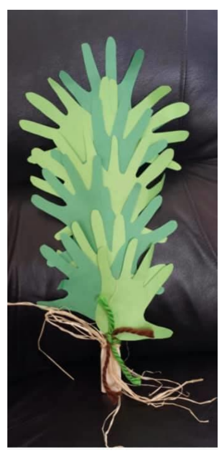
STEP 5. Ta-da!! You have a palm branch!