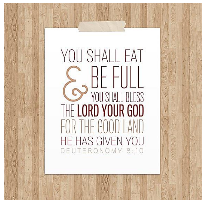
"First Give Thanks, and Then Give!"

"When you have eaten and are satisfied, bless the Lord your God for the good land he has given you. . . .But remember the Lord your God, for it is he who gives you the ability to produce wealth. . . " (Deut. 8:10, 18).