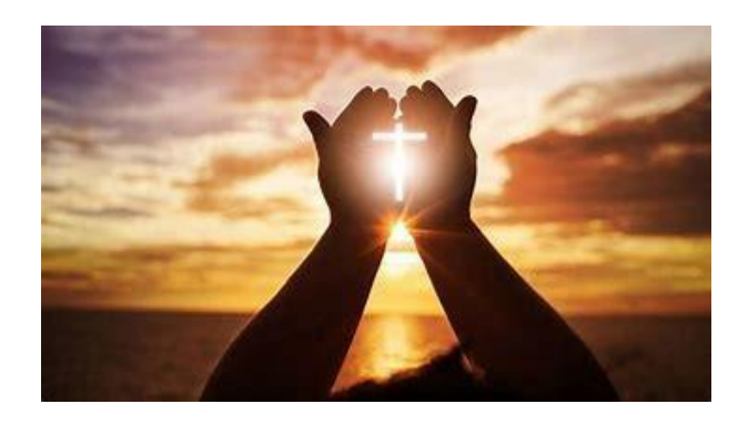
"The prayer of the righteous is powerful and effective!" James 5.16

Please lift up the following in your prayers: