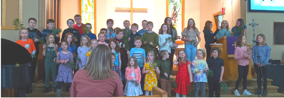
"Good in Every Way" performed by Kindred Kids on Palm Sunday

KINDRED KIDS YEAR-END PROGRAM SUNDAY, MAY 15 @ 10AM