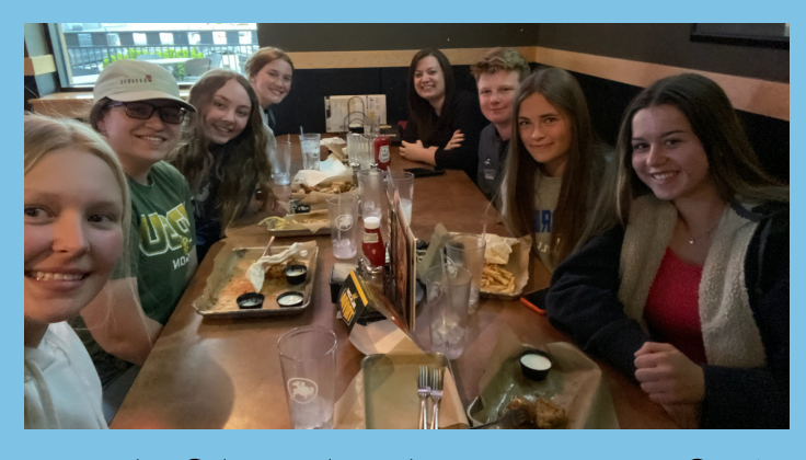
End of the school year supper fun!