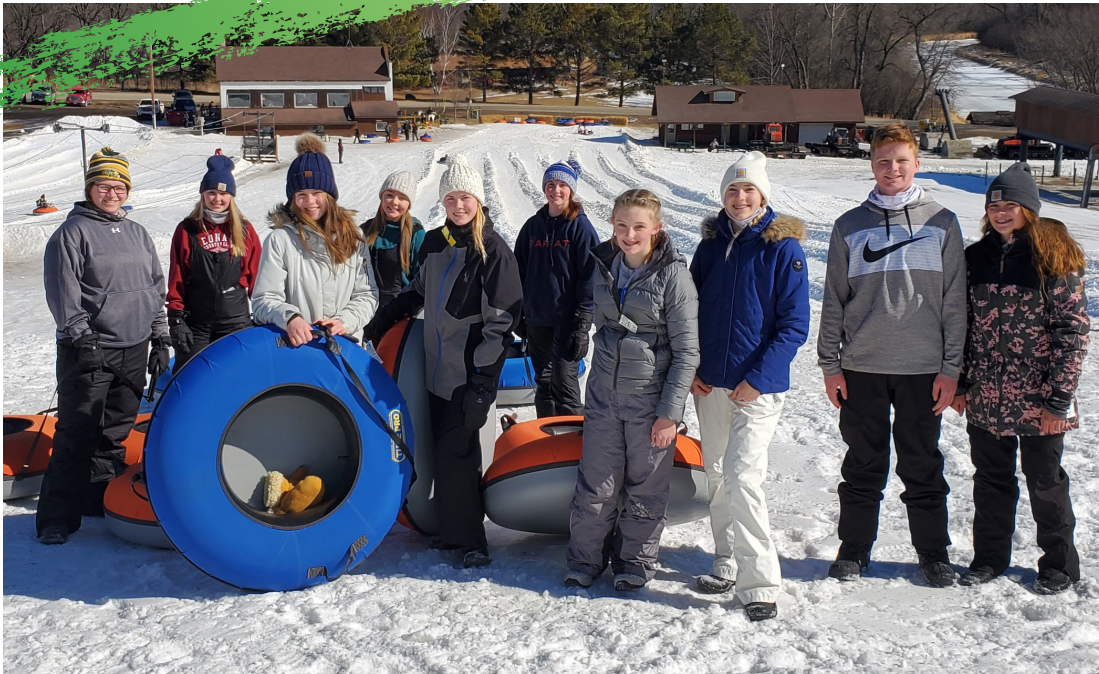
Tubing at Thrill Hills, Fort Ransom